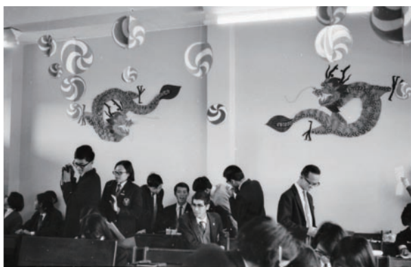
Festival of HK : Class room decoration of U6A for the Hong Kong Festival in December 1969. Former students of 74FA recalled that they won the decoration competition among all secondary schools when they were in Form 1A