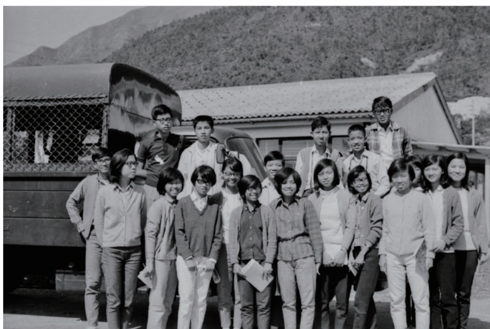
Round NT Trip - Students : 7 or 8 government lorries were hired to carry over 200 students round the New Territories