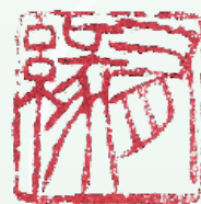
Seals of C.I. Group, with characters of 有緣 and 情長久

We all remember those good old days. They were really the golden days of love of friendship. Up to today, we still sing this song when we gather.