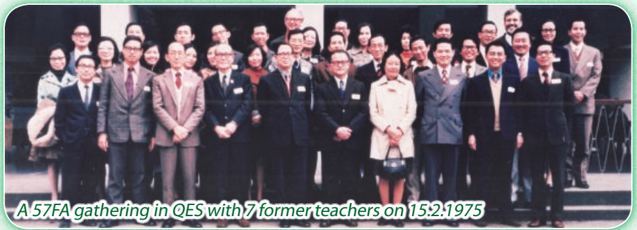
A 57FA gathering in QES with 7 former teachers on 15.2.1975

As the national treasury was in poor state, the King, the grandfather of the Prince, arranged him to marry a Princess of a rich neighbouring country. During a ball, the Princess complained about the unromantic behaviour of the Prince and remarked that he knew nothing about “warmth and charm”. The King upon advice from the Prince's tutor, sent him to the university in Heidelberg to learn about “warmth and charm” among the students. Upon arrival there, he did not like the carefree life style of the students, always singing and flirting with girls. In the inn where he stayed, he was served by Kathy, the inn-keeper's beautiful niece who told him how to get along with other ordinary students, not those from the European royal families, to know what real life should be. He gradually fell in love with this life style and Kathy. After a masquerade, he decided to run away with Kathy to Paris. At the last moment, the country's Prime Minister arrived and told him that the King was critically ill and needed his immediate return. He unwillingly bid farewell to Kathy and promised that he would return. When he saw his grandfather, pretending very well in front of the Prince, was not seriously ill, he immediately requested to return to Heidelberg. The King was fully