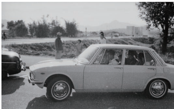
Round NT Trip - Teachers in car : Round New Territories trip organized by the Geography Society on 20.11.1968. The Geography teachers travelled together in a teacher's car