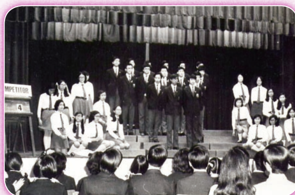
Form 4C students competing in the 1973 choral speaking competition

Our team won the Yvonne Charter Trophy. Looking at the enclosed photos, one could feel the joy of all the Form 4C classmates when it was announced that we were awarded the first prize for our performance. While the photos were taken in black and white 41 years ago (video camera and coloured pictures rarely used at that time), it was already a great record of the precious memory.